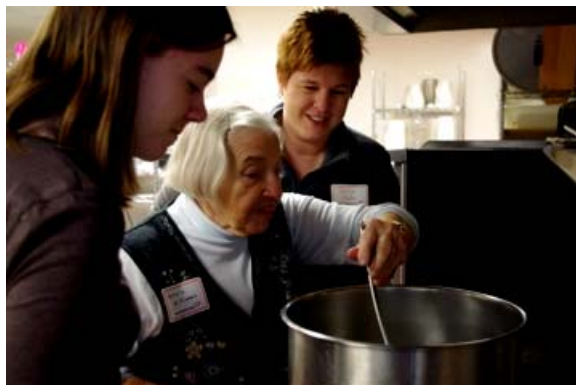
Three people of varying ages prepare dinner at the Salvation Army in Oshkosh as part of Servapalooza at First Congregational Church.

Groups at the church did a variety of tasks in different rooms at First Congregational Church. Some assembled hygiene kits that were shipped to the Church World Service Warehouse in Maryland. Others assembled "birthday party bags" for the Oshkosh Area Food pantry, so that kids from hungry families could celebrate a birthday with their families. Some people assembled trick or treat bags for the Boys and Girls Club of Oshkosh with healthy treats, while some created cards and notes that the Salvation Army will send to both veterans and active duty service members.