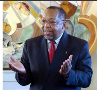
Rev. Geoffrey Black

The Rev. Geoffrey Black, General Minister and President of the Uni-ted Church of Christ visited Union Congregational UCC in Green Bay the weekend of January 22 and 23. Black helped the Green Bay congregation celebrate its 175 th